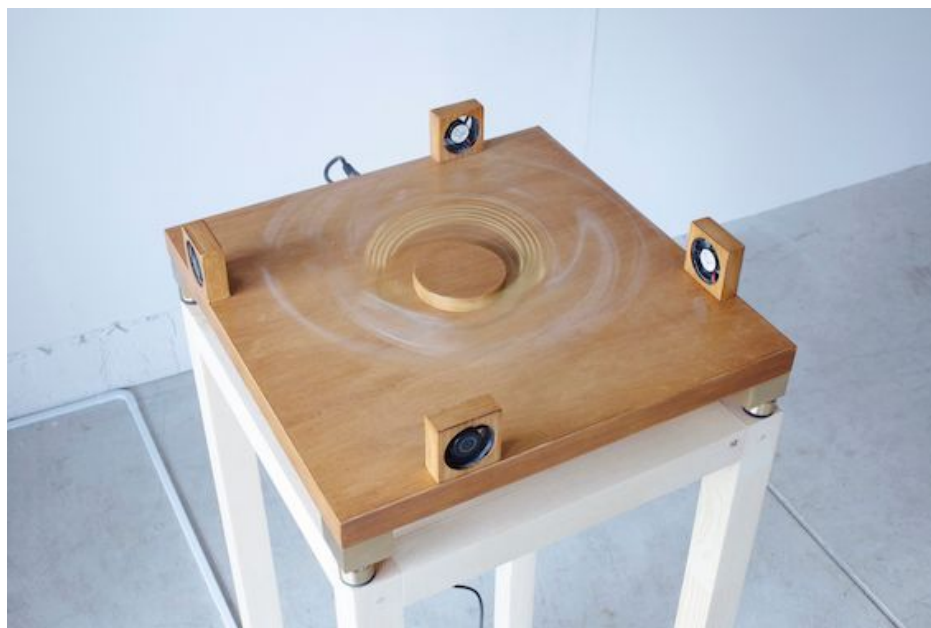
Spinning Light Bulb

October 26th (Saturday), 2019 18:00 - 20:00