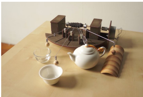
Sea Cucumber with Teavares